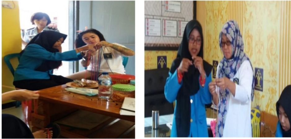
Figure 3. Submission of Material by Team

Correctional Institution and remarks from the supervisor and the head of the community service team, continued with the delivery of material regarding the manufacture of bags made of rope. Participants who attended this training were 7 female prisoners in Correctional Institution Ngawi.